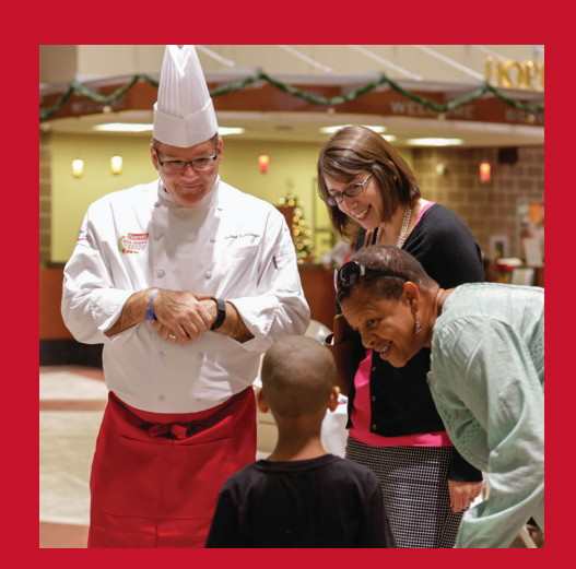
Campbell employees at the Campbell Healthy Community Kitchen in the Salvation Army Kroc Center in Camden.